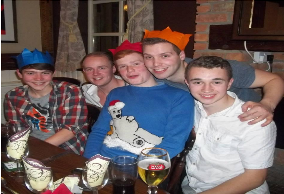
NSVL Christmas Dinner, Magic Lantern, December 2013.