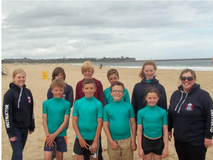
NSVL took part in the South Shields Rookie Festival as part of Drowning Prevention Week 2014.

NSVL were proud supporters of Drowning Prevention Week 2014, which was launched by the Royal Life Saving Society UK in 2012 to promote water safety and reduce incidences of drowning. This year, Drowning Prevention week ran from 21 st to 29 th June and NSVL hosted visits from two Scout groups, and visited a local Beaver group to provide water safety advice and demonstrate basic lifesaving skills. NSVL also took part in the South Shields Rookie Festival to mark the end of Drowning Prevention Week. The visits and competition were a great success and we hope our involvement in Drowning Prevention Week will increase in future years.