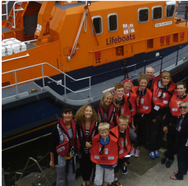
NSVL visit to Tynemouth RNLI-August 2013.

We plan to organise similar visits in the coming year and hope to maintain the relationship we have for many years to come.