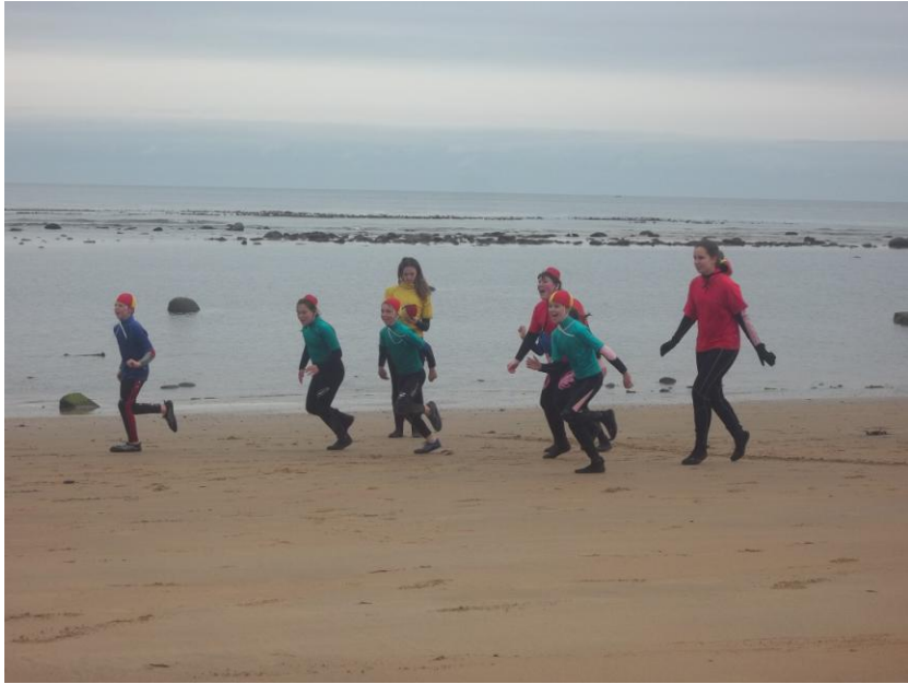
Summer Beach Sessions 2014